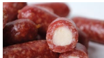
↑ Filled mini salami