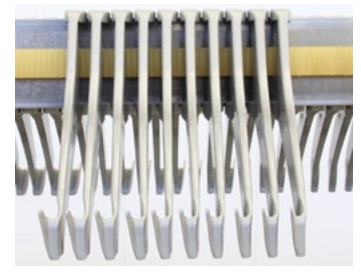
↑ Snack hanging option