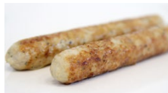
↑ Poultry sausage