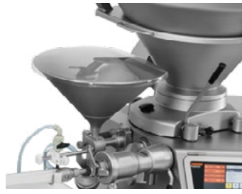
↑ Alginate feed unit