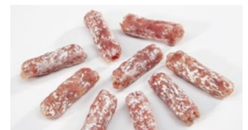
↑ Dry sausage sticks

Virtual Patent Marking: www.handtmann.com/patents-mf