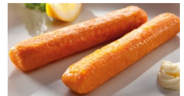
↑ Fish sausage