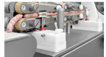
↑ Separating unit with separating module