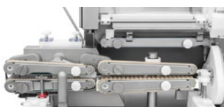
← Length unit with voider

The filling process runs continuously with the "Voiding" mode. The voider defines the exact linking position and, in conjunction with highly-dynamic linking, facilitates portioning accurate to the gram with equal lengths.