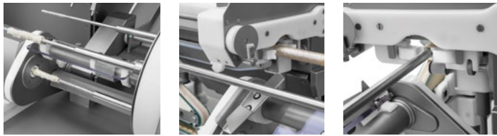
↑ 3-nozzle revolver