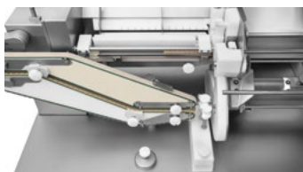
← Length unit

With Voiding mode, the filling process runs continuously. The voider defines the exact linking position and, in conjunction with highly-dynamic linking, facilitates portioning accurate to the gram with constant lengths.